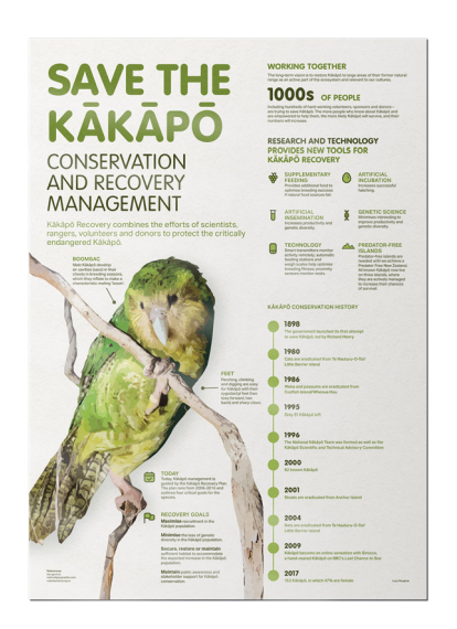
Research poster series breaking down the facts, statistics and information about the Kākāpō.