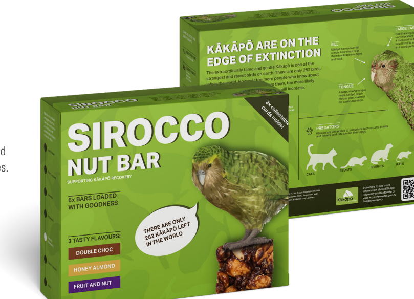
Box packaging uses graphs, diagrams and symbols to communicate information about the Kākāpō.