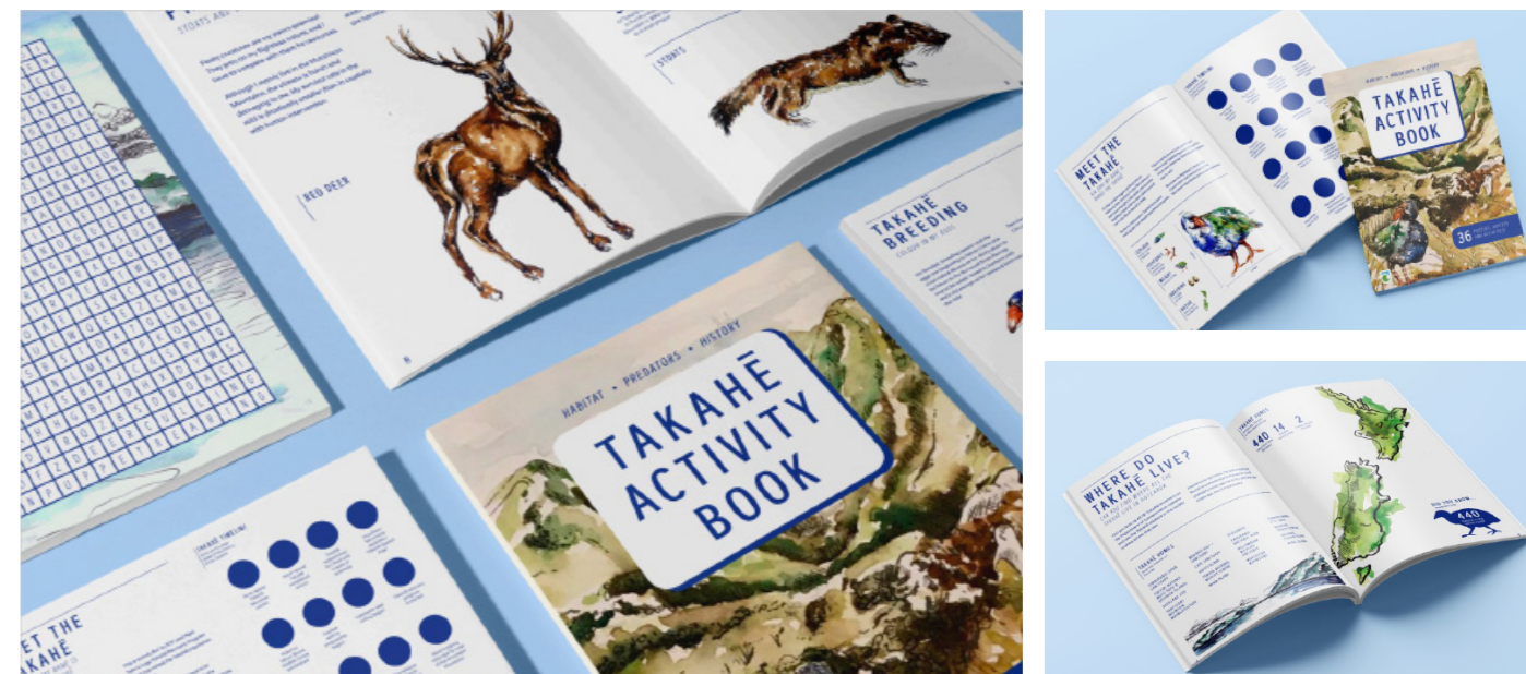
Takahe activity book

I designed stickers in a similar style to use on the pages of the book or place on their personal belongings. My aim was to encourage children to explore physical, make-and-do activities such as colouring in pages, word finds and flash cards to learn about the Takahe's history, habitat, predators, and local conservation efforts to protect and preserve them.