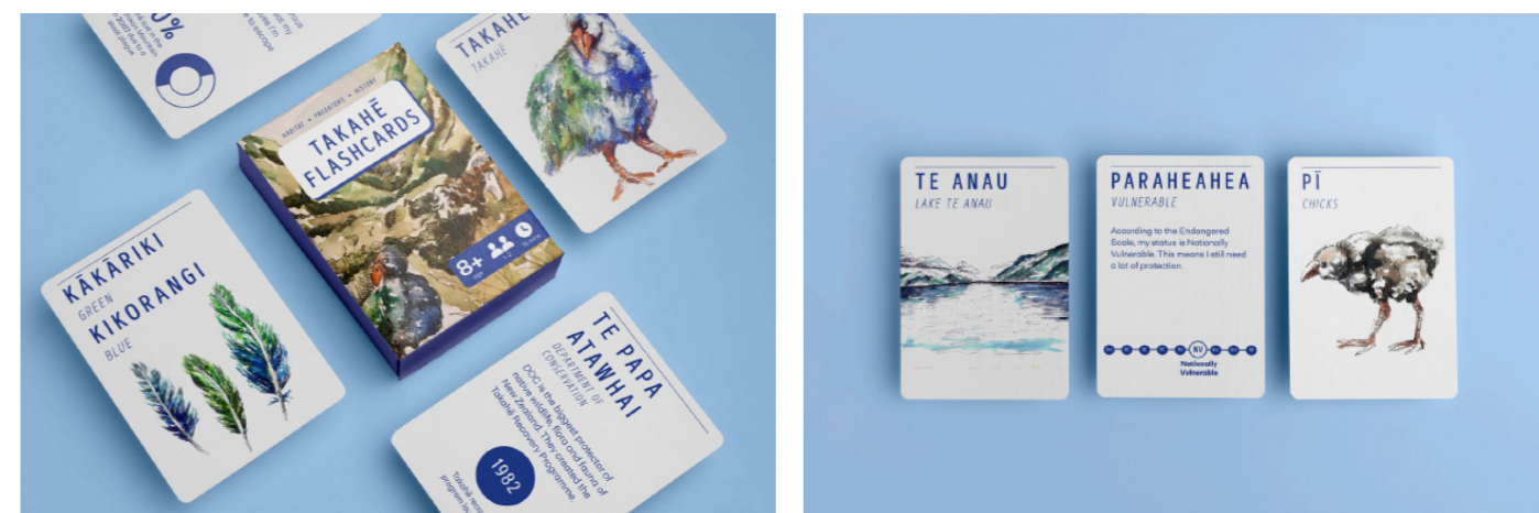
Takahe flash cards